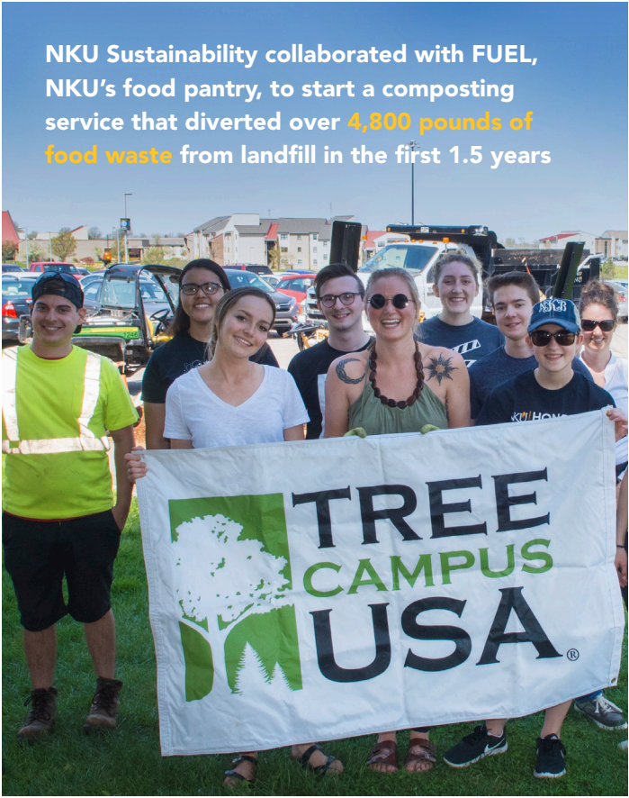
NKU Sustainability collaborated with FUEL, NKU's food pantry, to start a composting service that diverted over 4,800 pounds of food waste from landfill in the first 1.5 years