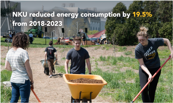
NKU reduced energy consumption by 19.5% from 2018-2023